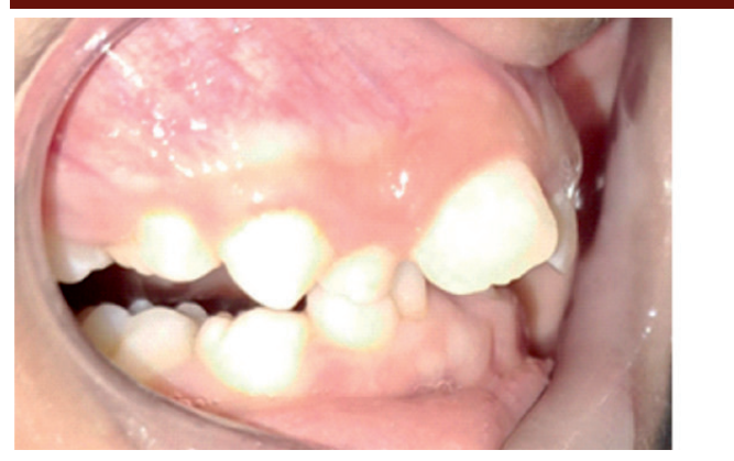
Figure 1 Laryngeal obstruction and moderate dentofacial disharmony (Patient no. 7 in Table 2).