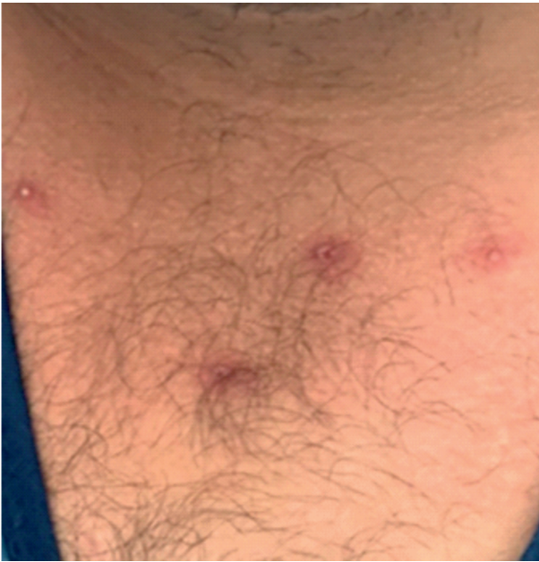
Figure 4 Vesiculopustular skin lesions on the upper limb.