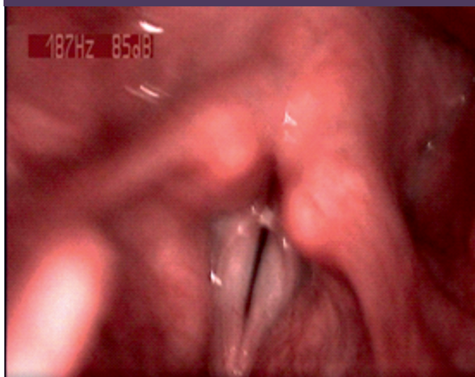
Figura 4 Videolaryngoscopy and stroboscopy after total recuperation. QR code for the video

After diagnosis, he was referred to speech therapy. The patient recovered rapidly and was asymptomatic after a month of treatment. Videolaryngoscopy at 3 months was normal and he was discharged from ENT