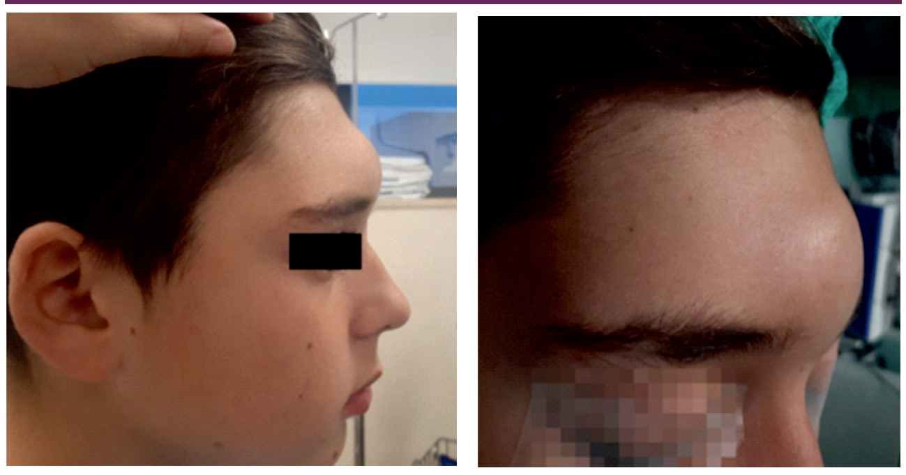
Pott's puffy tumor. Swelling in the frontal region due to a frontal subperiosteal abscess